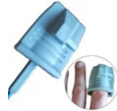
TSD124D Finger Clip

The TSD124 series human oximetry transducers are reliable and simple to use on a wide range of subjects for both short-term and continuous noninvasive monitoring. The TSD124B/C incorporate Nonin's PureLight® sensors and are backed by a six-month warranty. Use with the OXY100E oximetry amplifier or OXYSSH-SYS pulse oximetry system.