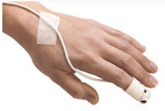
TSD124C Flex Wrap