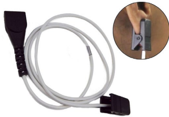
TSD124B Ear Clip