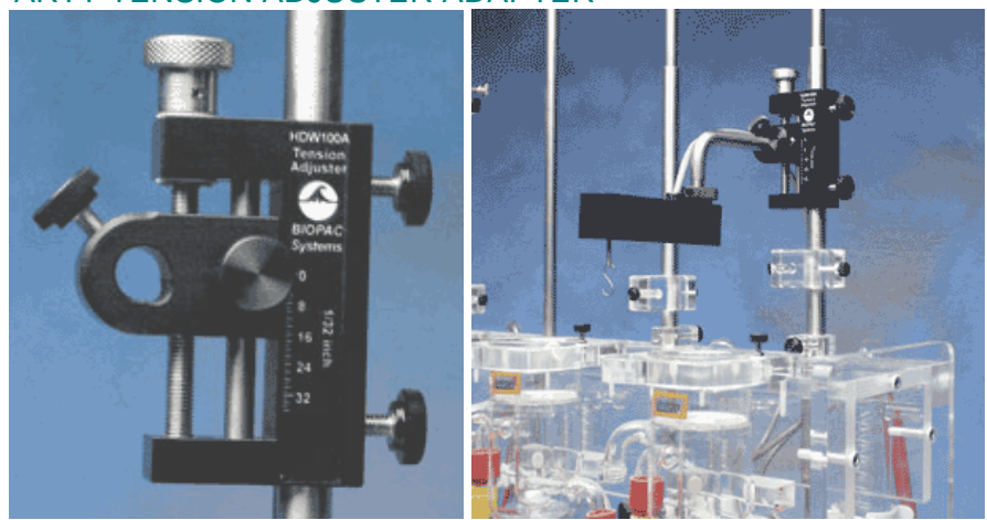
HDW100A and TSD125/SS12LA

HDW100A TENSION ADJUSTER HDW200A 3RD-PARTY TENSION ADJUSTER ADAPTER