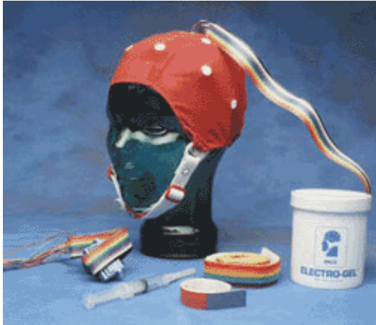
Electrode Cap System (CAP100C shown)

CAP-INFANT CAP-SMALL CAP-MEDIUM CAP-LARGE