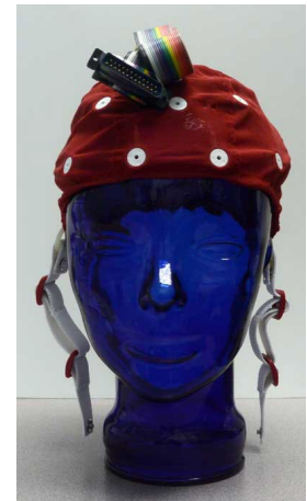
Cap only (CAP-MEDIUM shown)